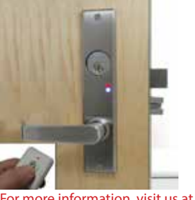
For more information, visit us at www.securitech.com/QID